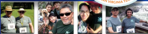
ARC TEAMWALK PHOTOS