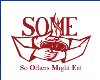
SOME – 1,000 meals to support Thanksgiving