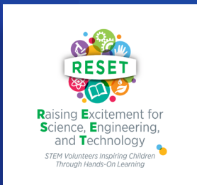
RESET is our STEM partner

Electrosoft team members routinely support the communities in which we live and work. We walk and run to raise money for charities, provide meals for food banks and Thanksgiving meals, and volunteer our time and talents to guide, support and inspire others.